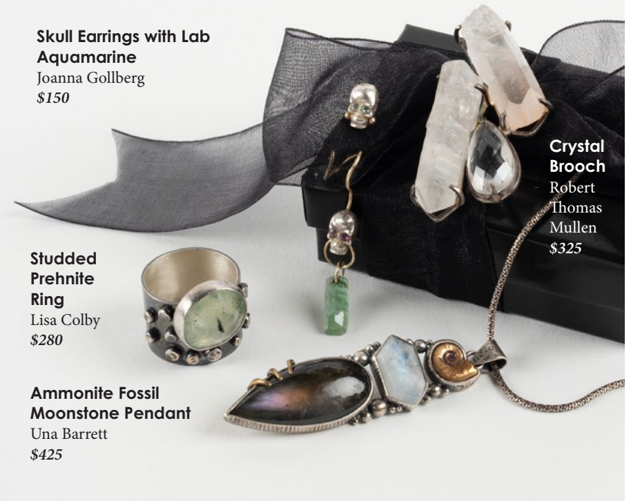
Skull Earrings with Lab Aquamarine Joanna Gollberg $150