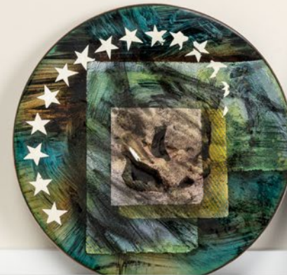
Enamel Stars Plate Bill Helwig $650