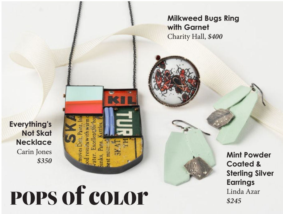
Milkweed Bugs Ring with Garnet Charity Hall, $400