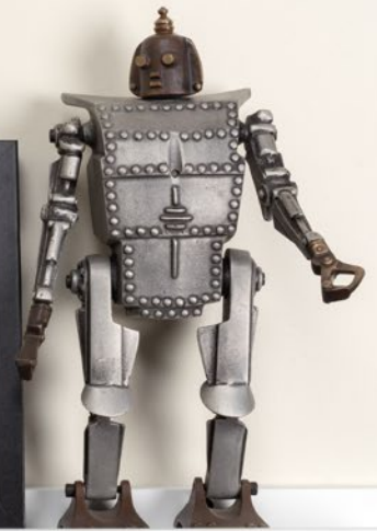
"Bob" Robot Coin Bank Nelles Studios $250