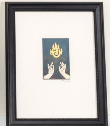
Conjure 1 Karin Jones $650