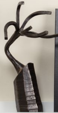
Coral Sculpture Reed Peck-Kriss $250