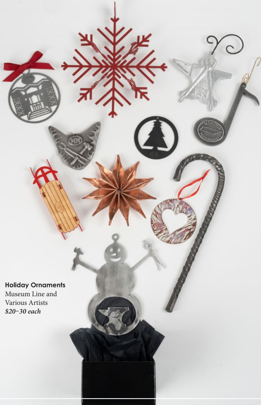
Holiday Ornaments Museum Line and Various Artists $20-30 each