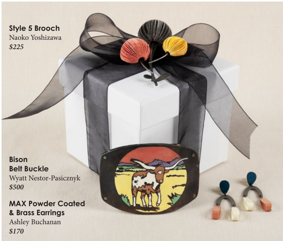
Style 5 Brooch Naoko Yoshizawa $225