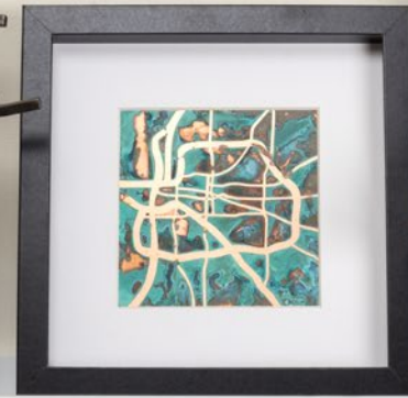
Framed Copper Art Lauren Estes $95